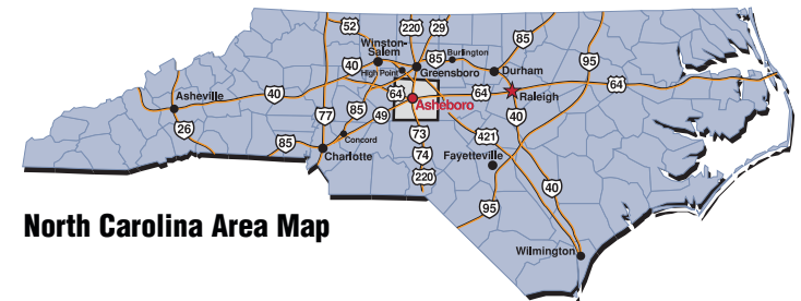
North Carolina Area Map